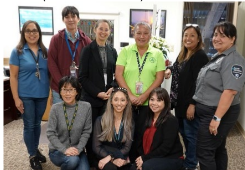
Hilo International Airport Office Staff (December 2023)