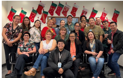
Daniel K. Inouye International Pass & ID Office (December 2023)

Every job at the airport is important. As we are getting back to our daily routines after the holidays, this is a good time to thank everyone for working hard through the holiday season as employees and travelers traversed our airports day in and day out. The Pass and ID Offices at Daniel K. Inouye International Airport, Hilo International Airport, and Lihue Airport shared group photos of their crew. Thank you to all the Pass and ID Office personnel for all they do to keep us credentialed and secure at our airports around the State of Hawaii. Have a great new year!