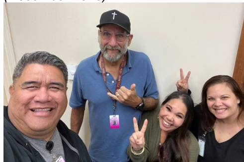
Lihue Airport Pass & ID personnel (November 2023)